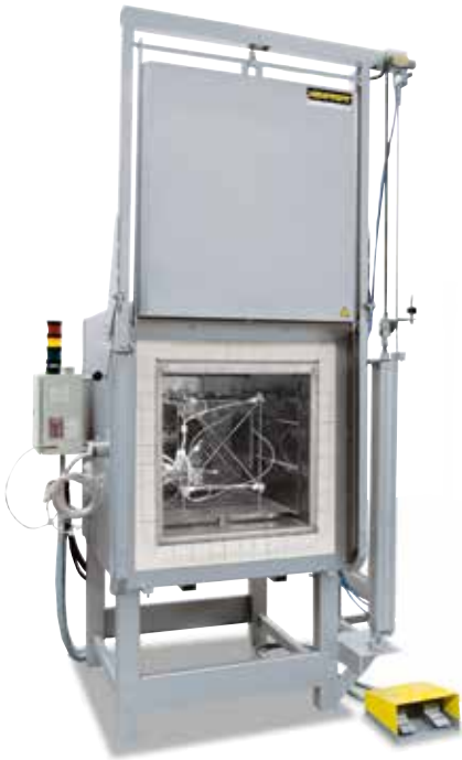
Holding frame for measurement of temperature uniformity

In standard furnaces a temperature uniformity is guaranteed as +/- K without measurement of temperature uniformity. However, as additional feature, a temperature uniformity measurement at a reference temperature in the work space compliant with DIN 17052-1 can be ordered. Depending on the furnace model, a holding frame which is equivalent in size to the charge space is inserted into the furnace. This frame holds thermocouples at defined measurement positions (11 thermocouples with square cross-section, 9 thermocouple with circular cross-section). The temperature uniformity measurement is performed at a reference temperature specified by the customer at a pre-defined dwell time. If necessary, different reference temperatures or a defined reference working temperature range can also be calibrated.